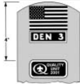
CUB SCOUT OR WEBELOS SCOUT RIGHT SLEEVE