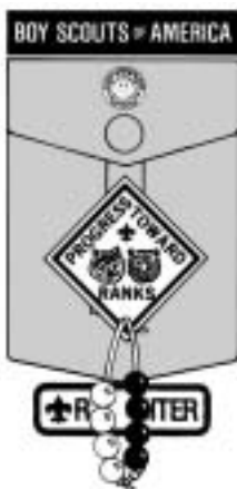
CUB SCOUT RIGHT POCKET

Conduct uniform inspections with common sense; the basic rule is neatness.