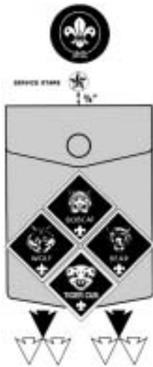
CUB SCOUT LEFT POCKET