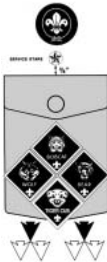
CUB SCOUT LEFT POCKET