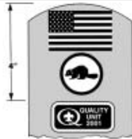
WEBELOS SCOUT RIGHT SLEEVE